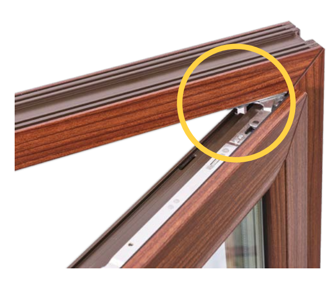
*for a window of 1480 mm x 1230 mm according to a study by the IFT Institute in Rosenheim

Frame – steel galvanized frame or energy efficient Swisspacer Ultimate frame available in gray, black or dark brown ensures a perfect match with the window color.